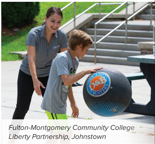
Fulton-Montgomery Community College Liberty Partnership, Johnstown