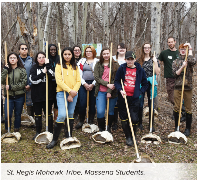
St. Regis Mohawk Tribe, Massena Students.

We bring our programs to the community in a variety of different ways. Whether it is an afterschool program, STEM camp, green classroom program, or a one-day workshop, we strive to build students' interest and confidence in science outside of the traditional classroom setting.