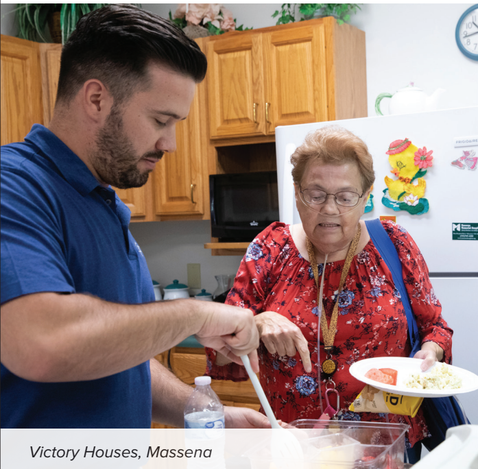
Victory Houses, Massena