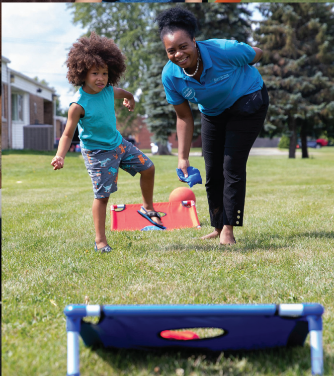
Massena Housing Authority, Massena