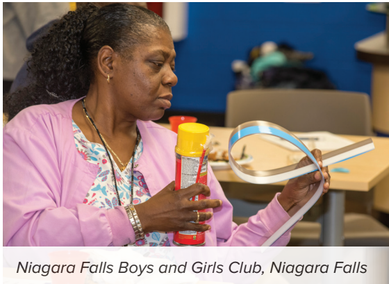
Niagara Falls Boys and Girls Club, Niagara Falls

help alleviate some of this burden by teaching low-income homeowners and renters simple and no-cost ways they can conserve energy and lower utility costs without compromising comfort or safety.