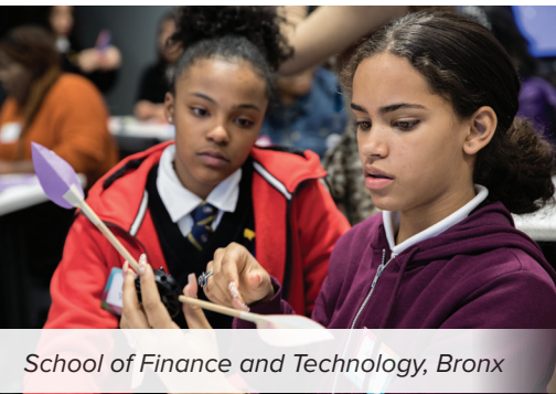
School of Finance and Technology, Bronx

Our supplemental STEM education program is designed to improve the academic performance of K-12 students who attend under-resourced schools in EJ communities. Our goal is to help level the playing field by providing age-appropriate, energy related education so students are better equipped to compete academically and professionally.