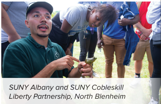
SUNY Albany and SUNY Cobleskill Liberty Partnership, North Blenheim