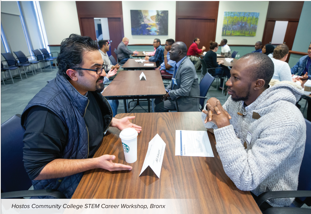
Hostos Community College STEM Career Workshop, Bronx

write an impactful resume and how to prepare for interviews. Another feature of this initiative is speed mentoring. Students engage in a fun exercise whereby they get a wide range of career and educational and advice from NYPA professionals. Career panels also provide a relatable way to share personal stories and help students understand pathways to professional success.