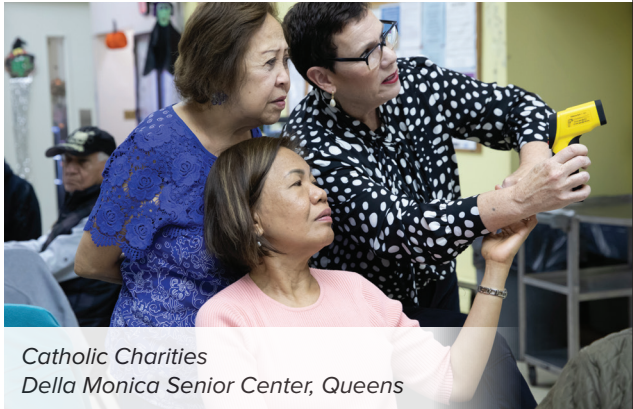
Catholic Charities Della Monica Senior Center, Queens