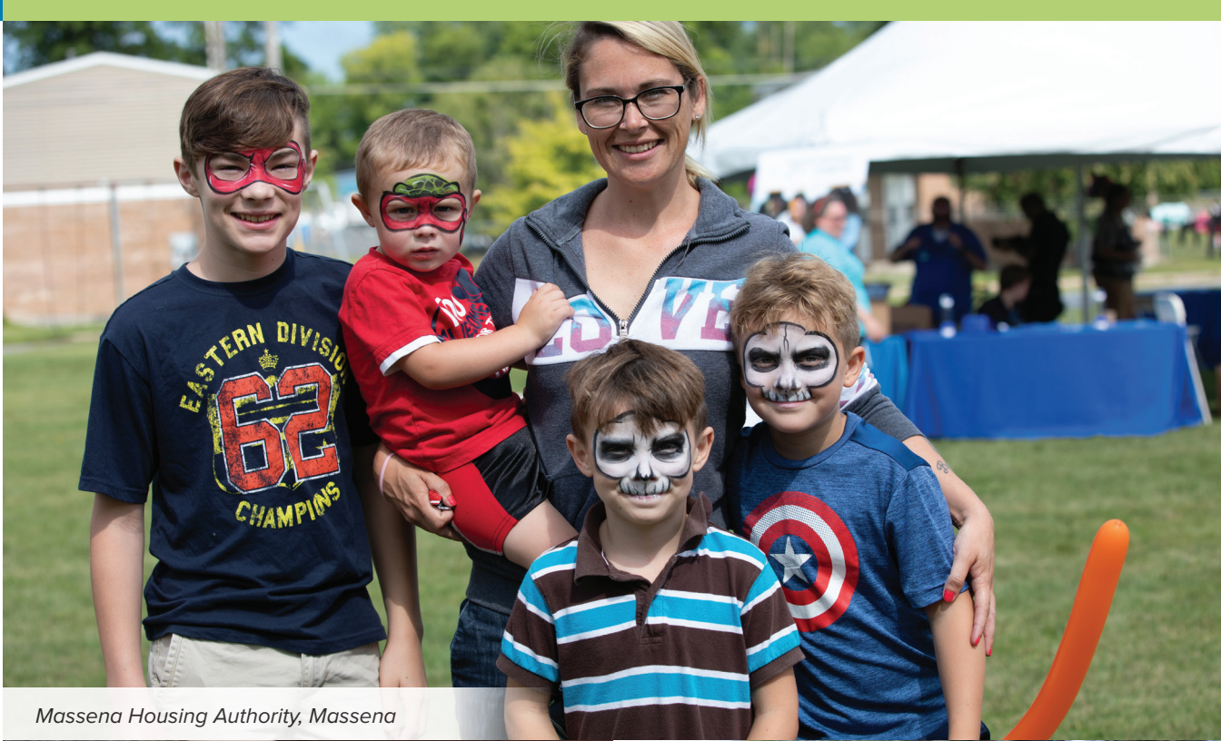
Massena Housing Authority, Massena

These opportunities help us develop a deeper, one-on-one understanding of the concerns and challenges of the families and residents who live in EJ communities.