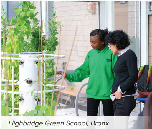
Highbridge Green School, Bronx