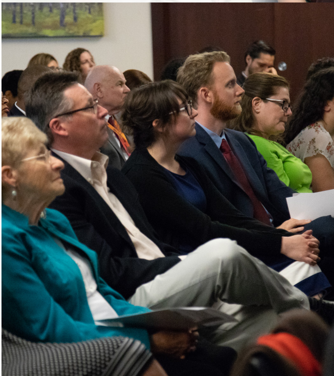
Community Meeting, White Plains

NYPA recognizes the need to include all marginalized communities in the benefits that accrue from a clean energy economy. A critical part of our Environmental Justice mission is to act as the internal voice of the community to ensure that an Environmental Justice lens is applied to all of NYPA's strategic planning efforts and operations.