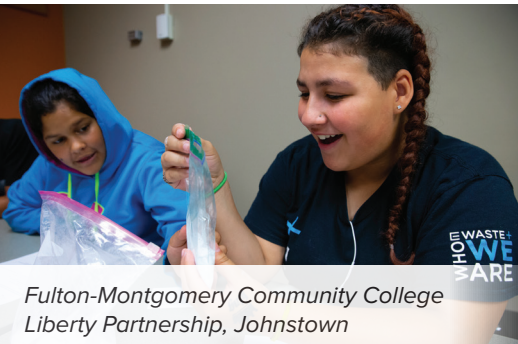
Fulton-Montgomery Community College Liberty Partnership, Johnstown