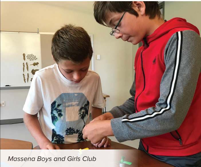
Massena Boys and Girls Club