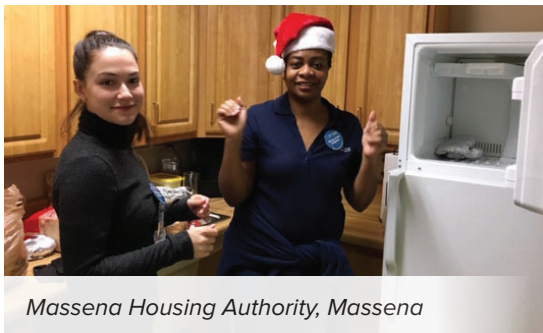
Massena Housing Authority, Massena

Environmental Justice communities often lack the funding to implement energy efficient technology that can improve quality of life. NYPA's EJ staff work with our partners to identify opportunities for us to help. We are currently engaged in ongoing planning for long-term energy services projects that are provided at no-cost to our communities.