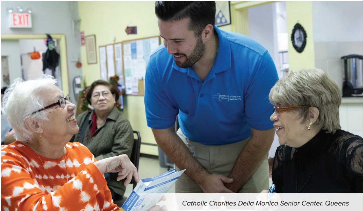
Catholic Charities Della Monica Senior Center, Queens