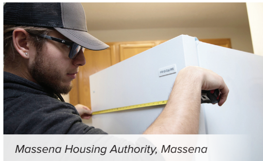
Massena Housing Authority, Massena