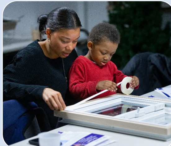
Community Energy Literacy