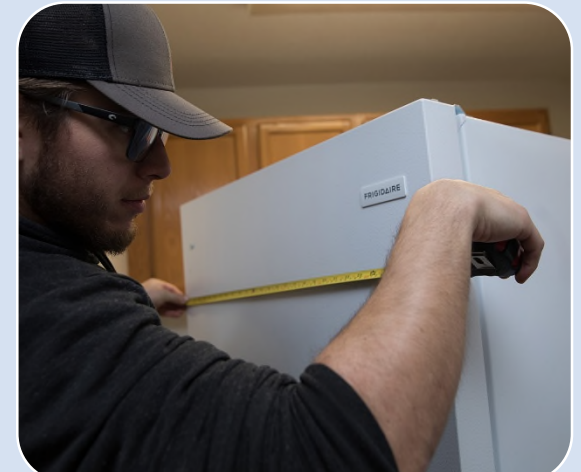
Energy Efficiency Projects