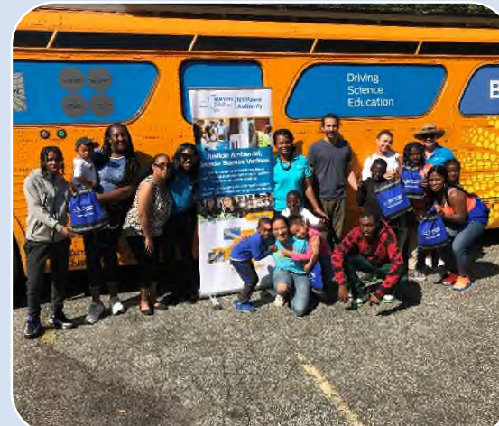
Community Outreach and Advocacy